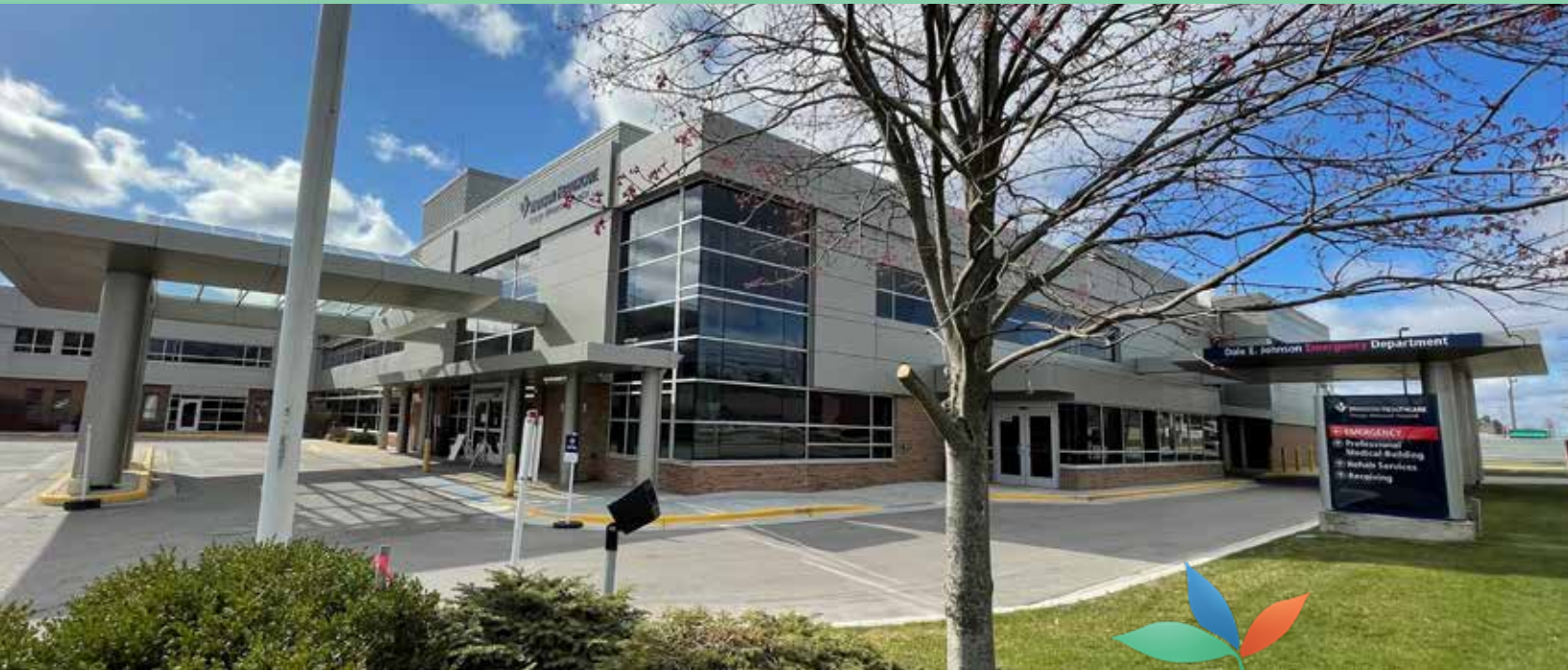
The updated Dale E. Johnson Emergency Department at OMH features separate entrances for patients and EMS, which streamlines traffic for staff, patients, and visitors.

BUILDING THE LOCAL FUTURE OF HEALTHCARE a campaign for Otsego Memorial Hospital