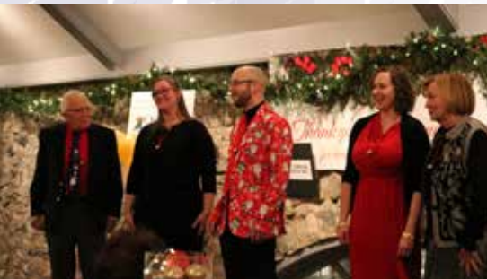
Staff and community members celebrate Charlevoix Hospital at the 2019 Holly Daze event, before COVID-19.