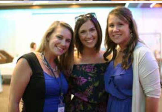
A blast from the past: community members gather in support of Cadillac Hospital and Munson Hospice during the 2018 Power of the Purse and Hospice Breakfast events.

Resiliency, gratitude, and unity – these words come to mind as I reflect upon the last 12 months.