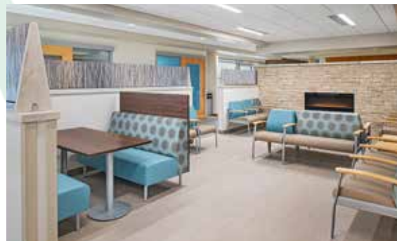
Photos top to bottom: new private rooms in the Ambulatory Care Department, the expanded surgical suite, and an updated waiting area for loved ones.